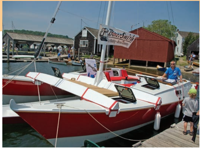
Abaco on display at the Mystic Wooden Boat Show. The 30-foot catamaran drew a steady stream of interested visitors.