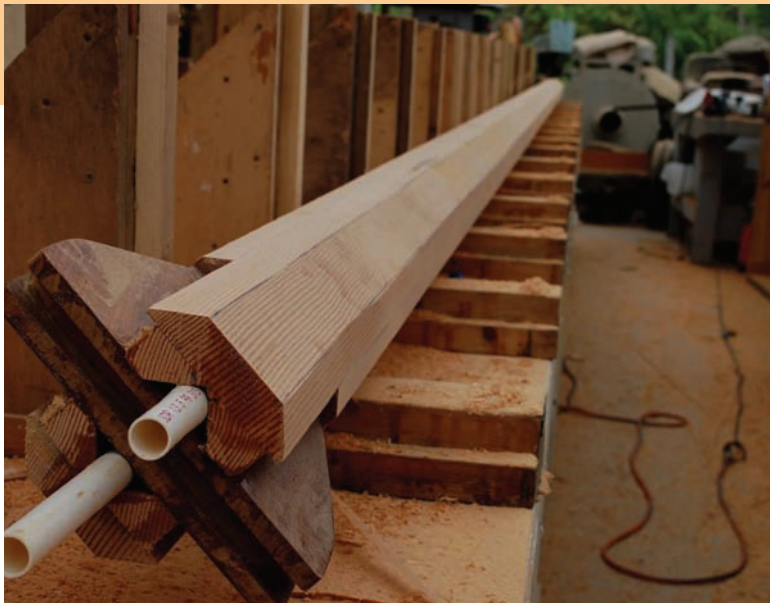
Here is the 32-foot mast after laminating but before final shaping to round. The first step in rounding a square mast is to cut it to 8 equal sides, then 16, then 32.

exceeding the legal width limit. While the Tiki 30 is not the kind of boat you can keep at home and quickly put together for an afternoon sail, it is quite feasible to dismantle it and trailer it to the Chesapeake or the Sea of Cortez. For Southeastern sailors, the ability to get it on a trailer to move inland or north in advance of a hurricane is something to consider.