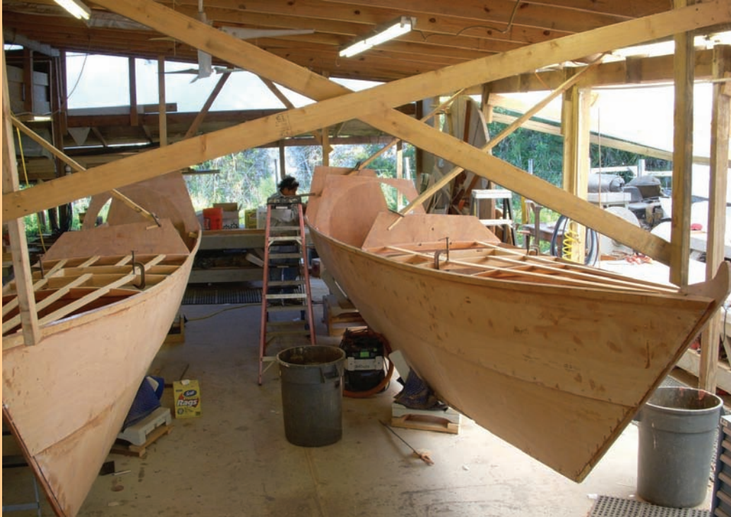
Both hulls were built side-by-side, braced to the shop floor and rafters to keep them aligned until they were rigid enough to be moved. Here you can see the forward deckbeams have been installed.

out any underwater appendages such as dagger boards that could be damaged in a grounding. Designed as a tropical cruiser, the Tiki 30 features a double bunk in each cabin, as well as immense deck and cockpit space, part of which can be converted to accommodations under an optional deck tent. There is a basic, but adequate galley in the port hull and a nav-station to starboard. Wharram designs boats that sail well, and above all are safe and seaworthy. He refuses to compromise these characteristics for comfort, so you won't